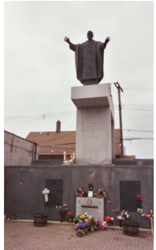
Pope John Paul II Park, Hamtramck, Michigan, April 30, 2005.