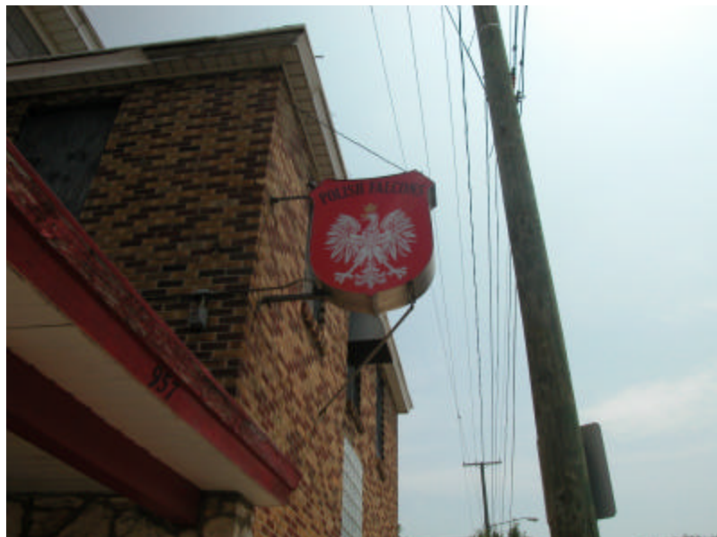
Exterior, Polish Falcon's Nest, Grand Rapids, Michigan.

Finally, the Board decided to set policies on funding projects. The Board agreed that it would consider requests to fund the publication of works, but it would not fund research or translation.