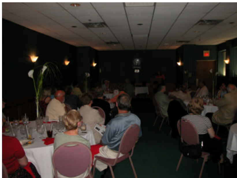
Reception, Grand Rapids, Michigan, June 25, 2005

Grand Rapids also hosts Pulaski Days on the first full weekend in October to honor General Casimir Pulaski, to create awareness of Polish contributions to society, and to bring together people of all nationalities. For more information consult: www.pulaskidays.org .