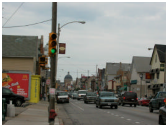
Lincoln Ave. and 16th St., Milwaukee, Wisconsin. St. Josaphat's Basilica's dome is at center.