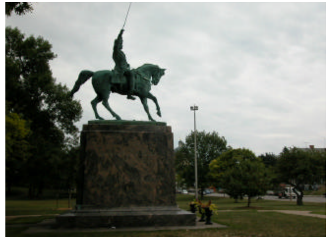
Kosciuszko Statue, Kosciuszko Park, Milwaukee, Wisconsin.