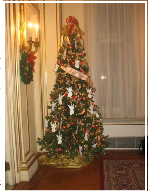
Christmas Tree, Polish Consulate General, New York City