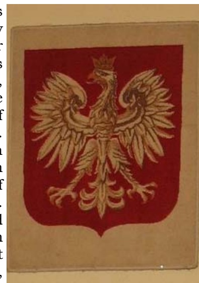
Wallhanging, Polish Consulate General, New York.