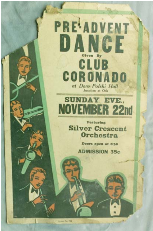
Left, Pre-Advent Dance Poster from window of west side Detroit Dom Polski, ca. 1935. Below, First national convention of the Polish National Alliance, held in 1913 at the east side Detroit Dom Polski at 2281 Forest.